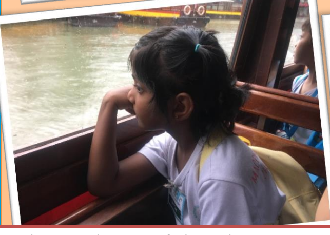
What a beautiful sight to see.