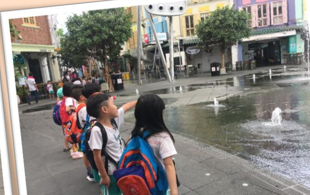
Can we play with the water?