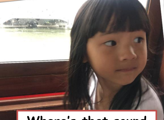
Where's that sound coming from?