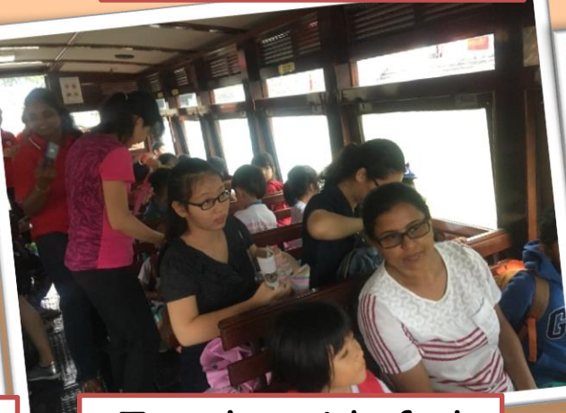
Together, it's fun!