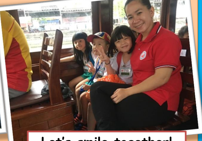
Let's smile together!