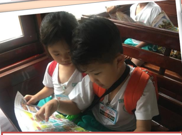
So, where are we now?