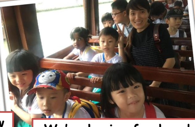
We're having fun here!