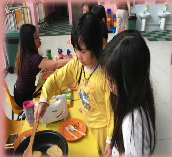
Preparing our own breakfast