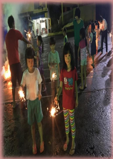
Fun with fire sparkle